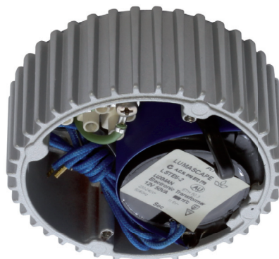
LSTE6-2 Integral Transformer 12 V AC Output