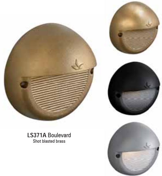
LS371A Boulevard Shot blasted brass

NOTE: Product specifications are subject to change without notice. Any luminaire can become hot - take care with appropriate use and placement.